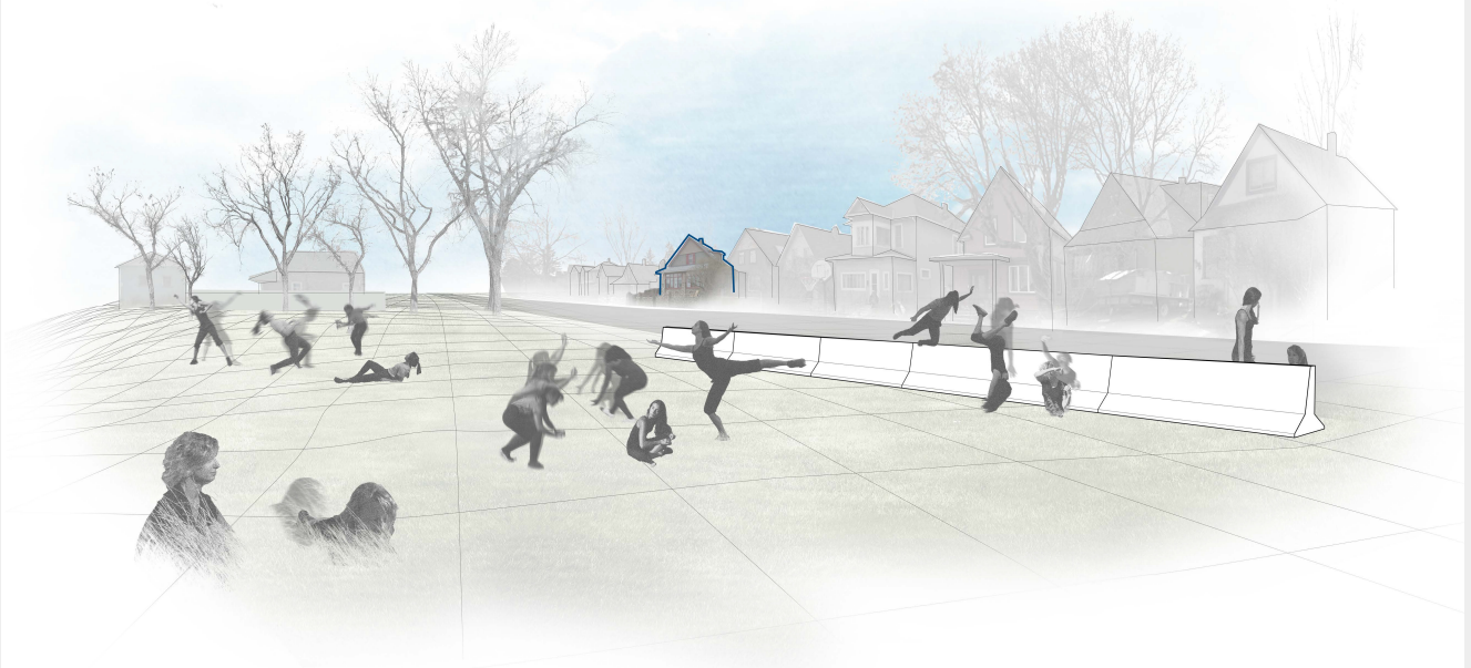
Jeffries Park, North America.