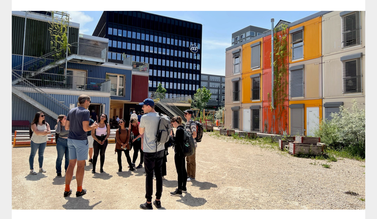
Students participating in the Zurich Study Abroad program visited FOGO, a temporary, mixed-use development where a housing and training centre for refugees shares space with start-up offices, artist workshops, a teaching and development kitchen and student housing.