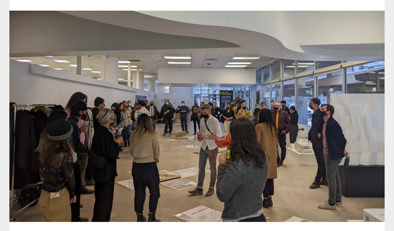
Work Integrated Learning Studio 'Show and Tell' December 2021.