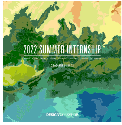
READY TO LEARN MORE? ATTERO OUR VIRTUAL INFORMATION SESSION! JANUARY 28 TPM EST Attendes will receive an introduction to Design Workshape, most a former internet stander designs and the filter particular in a specific