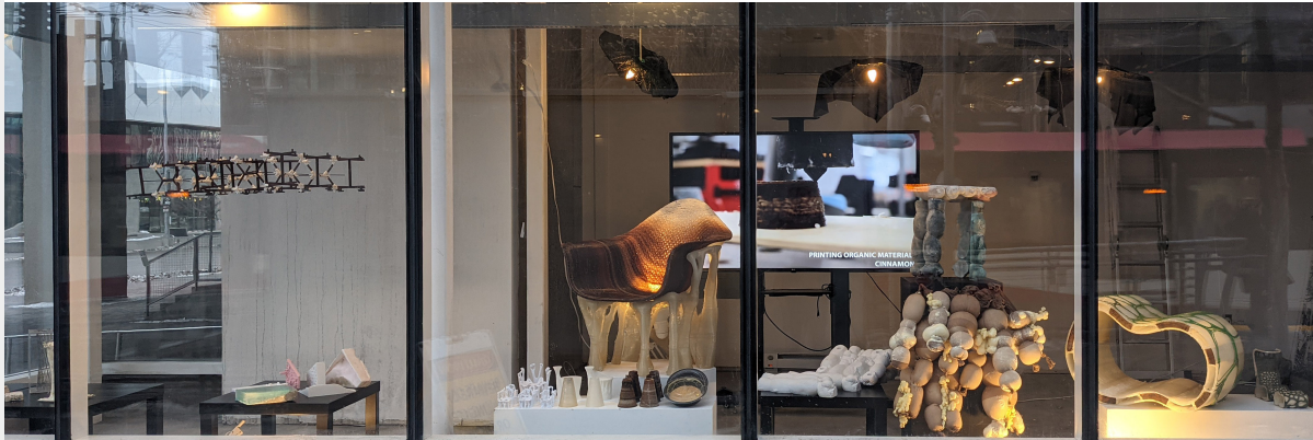
Image credit: 'FlowState: translated prototypes' exhibition, from the ARCH680 Integrative Casting course led by Guy Gardner (details below).

*Mandatory! Last Chance!* Students if you haven't completed Workshop Training for 2021-2022, this is your final chance to do so . Visit the link below for information about specific training sessions and dates. If you need the Zoom Details, look for the calendar invites sent out by Jes Alder on January 3, or reference Tracy's email sent on January 3 at 4:15pm.