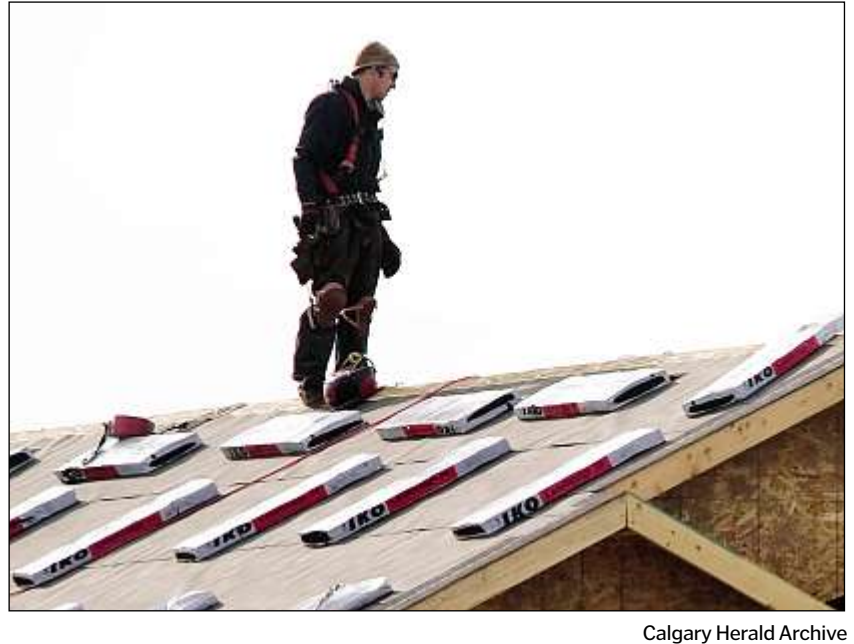
The housing industry is facing opposition to densification projects.