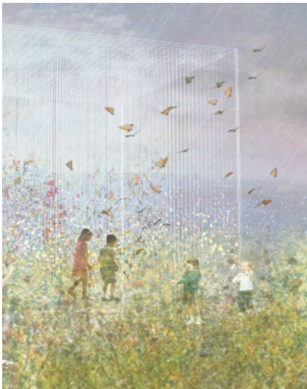
Brewing Flower Power: An Ice Teaporium Celebrating Women's Rights , London, United Kingdom

Organized in teams of one to five, 405 people from around the world participated. The competition elicited 145 submissions from 108 cities representing 26 different countries.