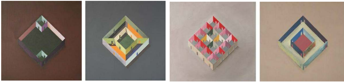
Spatial Structure by Pezo Von Ellrichshausen