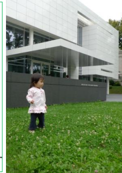
photographs & sketch © brian r. sinclair

"When shelter is perfected for need, it is not in material terms alone." Paul Oliver (Habitat International)