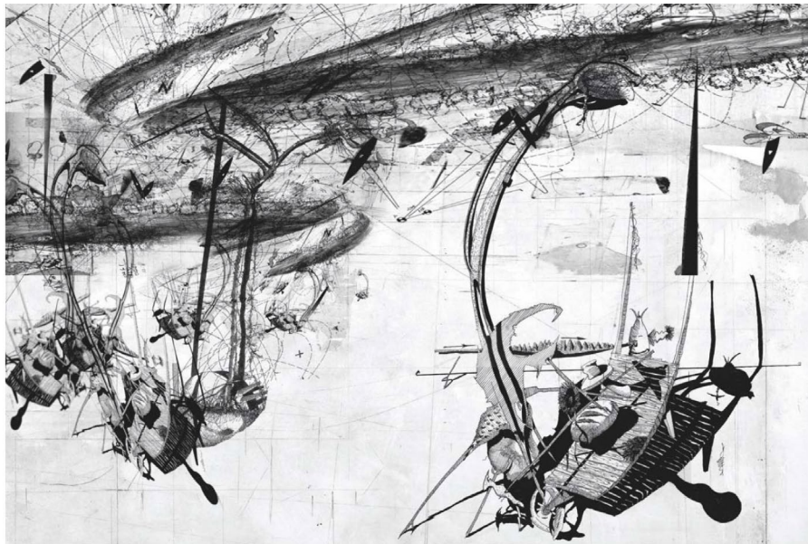
Neil Spiller, Baroness's Filaments in Full Frenzy, 2009. 1

A seminar and workshop abets the goals of the Senior Research Studio by examining hybrid drawings as investigative tools in the design process. The course intends to make space for the orientation of student drawing practices to a collision of speculative operations and physical materials.