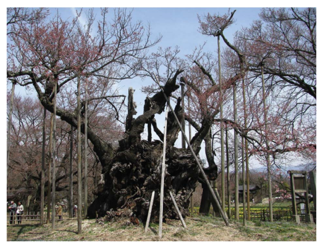
Henderson, Ron. Yamataka Zindai-zakura, 2000 year old cherry tree in Japan, 2012. Repair: Sustainable Design Futures, 2023.

Assignments that are submitted late will be penalized one letter grade per 24 hours (ie. work evaluated at an A that is submitted one day late will received a grade of A-). Assignments submitted late by 4 days or more may constitute automatic failure.