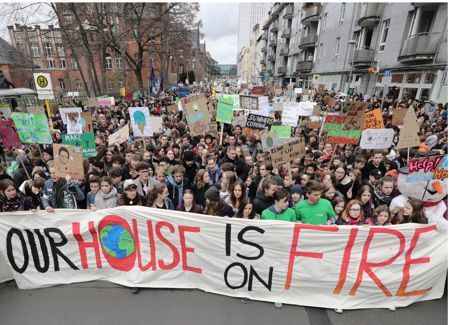
Greta Thunberg leading a climate demonstration in 2019 in Berlin.

Office Hours: by appointment only [PF 3193, online] | alberto.desalvatierra@ucalgary.ca