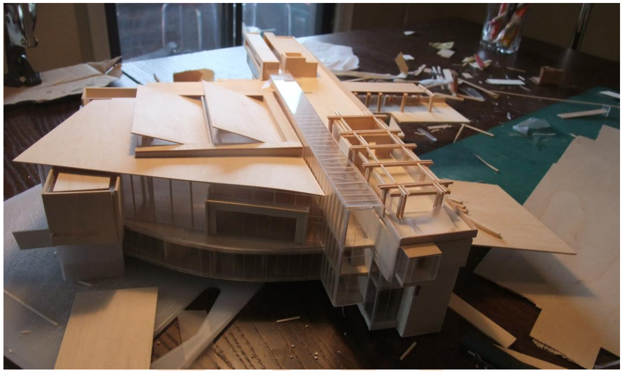
Centre for Human Values - sinclairstudio + RK Architecture

Site: Fort Calgary , Calgary, Canada (three distinct site options provided - with site areas and finite boundaries to be provided by teaching team)